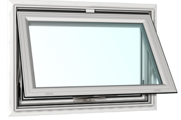
MODEL 9100 (NEW CONSTRUCTION)