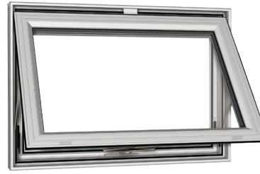
MODEL 8100 (REPLACEMENT)