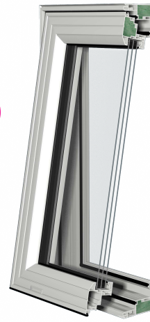
MODEL 8100 (REPLACEMENT) TRIPLE GLAZED