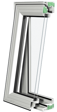
MODEL 8100 (REPLACEMENT) DUAL GLAZED